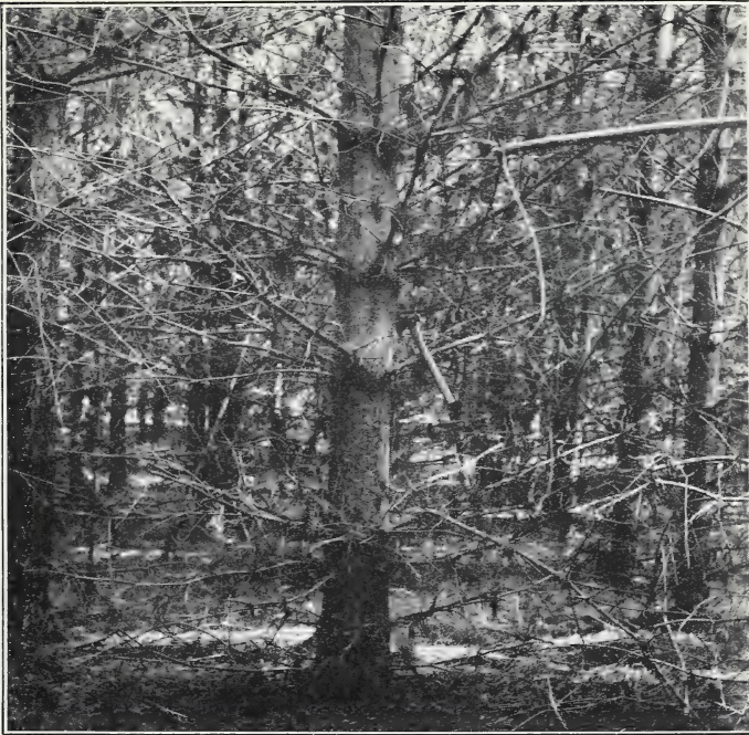
FIG. 1.—WHITE PINE PRUNES ITSELF POORLY WHEN GROWN IN PURE STANDS.